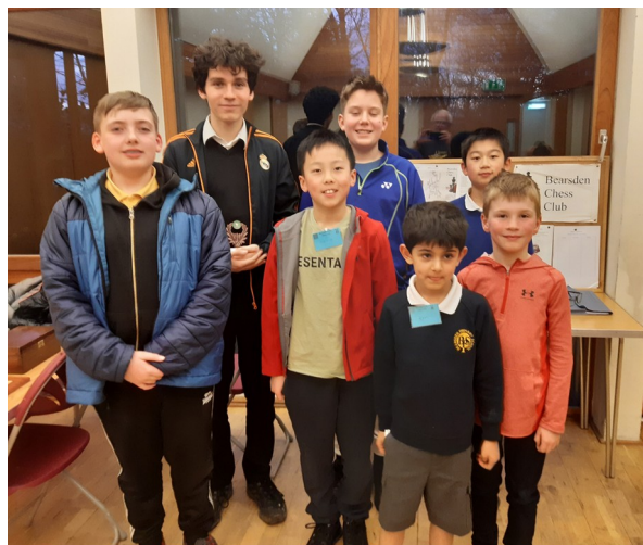
Bearsden Juniors Allegro Tournament

The Club has five teams across the Glasgow and Dumbarton Chess Leagues with a new team added last season primarily for Juniors and recently-joined members. In 2023 our Dumbarton A team won the Dumbarton League and next season our Glasgow League A team is promoted back to the top division.